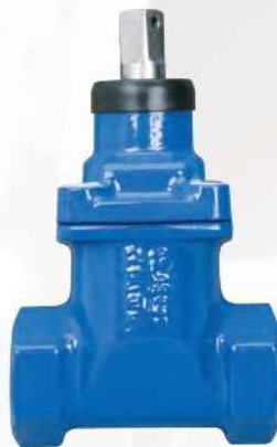
DN32, DN40, DN50